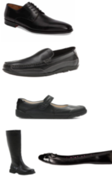
Grades 1-8 Acceptable Shoe Examples

Ties & gym uniforms may be purchased through the school at the front desk or at the annual Ice Cream Social. Lower and Middle Division ties are different; Grades 1-4 wear dragon ties and Grades 5-8 wear crest ties.