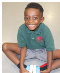
Early Childhood Uniform examples